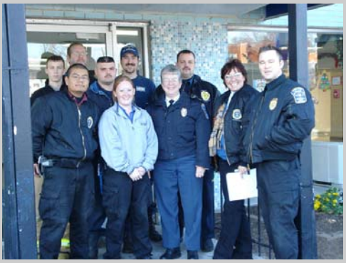
Fire, Police and Code Enforcement Spreading Holiday Cheer-2010